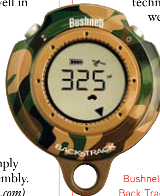
Bushnell's Back Track is an incredibly easy-to-operate GPS unit that also features a digital compass.

folding knife models to its extensive line in the PowerFrame and F.A.S.T. spring-assisted opening technology. The new Crucial multi-tool weighs only 5 ounces and folds as compactly as a pocketknife, yet provides many of the features of the larger Multi-Plier line. An interesting addition is the Cut Release Tool (CRT), designed to quickly and safely cut flex-cuff restraints. (307-857-4700; gerbergear.com )