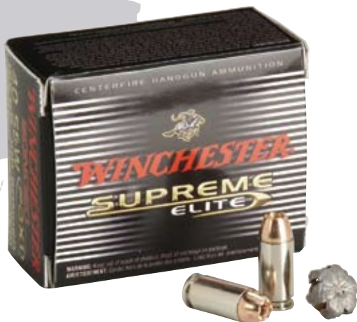
Winchester Supreme Elite Bonded PDX1 is now available in 9mm, .40 S&W, .45 ACP and .38 Special. The Ranger SXT line is getting a new bonded JHP load as well.

Given the wide range of tactical products already on the market, new products need to emphasize some sort of improvement. As a result, we're seeing new gear that is lighter, stronger, more powerful and more versatile. Although the dominant trend in this year's tactical product lines center around long guns and accessories for them, there is more to the tactical market than guns and lasers. Here's a look at some other products being introduced for 2009.