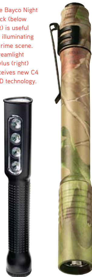
The Bayco Night Stick (below left) is useful for illuminating a crime scene. Streamlight Stylus (right) receives new C4 LED technology.

This year, Surefire introduces 4-Die LED upgrades into its new product line, and as conversion heads for many existing products. This includes weapons lights and hand-held flashlights that boast greatly increased power output with minimal (if any) weight and size increases. (800-828-8809; surefire.com )